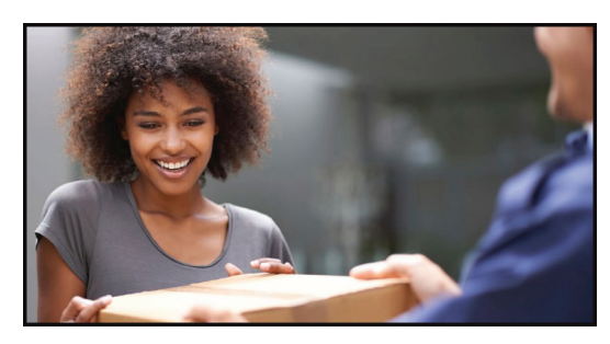
Or, send them to the recipient's home to engage family or to recognize remote employees.