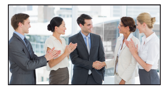
Presentation boxes may be sent to office locations for managers to present.