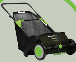
Earthwise Leaf Collecting Lawn Sweeper