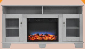
Cambridge® Electric Fireplace Entertainment Stand