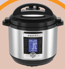
Instant Pot® Ultra 8-Quart Pressure Cooker