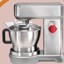
Wolf Gourmet Stainless Steel Stand Mixer