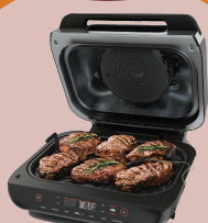
Ninja® Foodi Smart XL 6-in-1 Indoor Grill