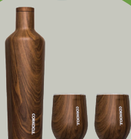
Corkcicle® Wine & Shine Bundle