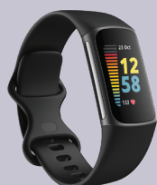
Fitbit® Charge 5 Fitness and Health Tracker