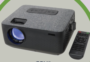
GPX® Rechargeable Projector with Bluetooth