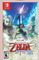
Nintendo® Legend of Zelda: Skyward Video Game