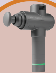
Hyperice Hypervolt 2 Percussion Massager