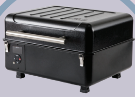
Traeger Ranger Tabletop Pellet Grill Package