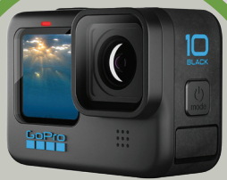
GoPro® HERO10 Black Action Camera