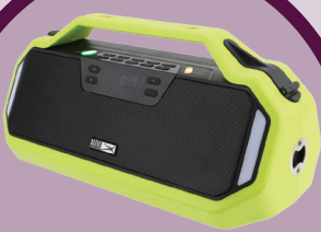
Altec Lansing® StormChaser Emergency Wireless Speaker