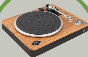
Marley™ Stir It Up Wireless Turntable