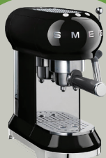
SMEG Retro-Style Espresso Coffee Machine