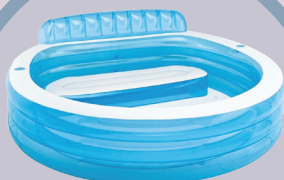
Intex Swim Center Family Lounge Pool