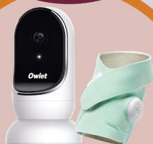
Owlet® Dream Duo Smart Baby Monitoring System