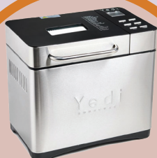
Yedi® Housewares Bread Machine with Accessories