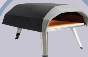
Ooni Inc. Koda 12 Gas Powered Pizza Oven