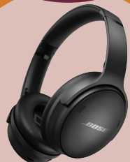
Bose® QuietComfort® 45 Headphones