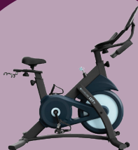
Echelon GT+ Connect Bike