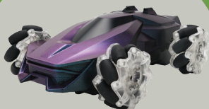
Odyssey Toys Trailblazer Fog Car