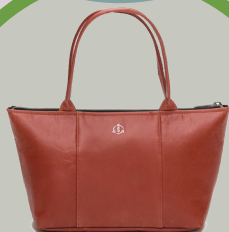
HHPLIFT Daydreamer Tote